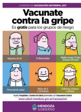
Photo 5. Campaign: Get a flu shot. Graphic piece newspapers and magazines.