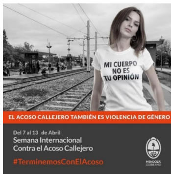
Photo 3. Campaign: Let's end harassment. Facebook piece.