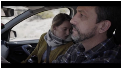
Photo 4. Campaign: Nothing happens until it happens. TV notice.