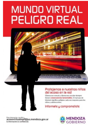
Photo 7. Campaign: Virtual world, real danger. Graphic piece newspapers and magazines.