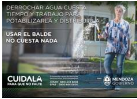
Photo 6. Campaign: Take care of it so there's no shortage of it. Graphic piece for outdoor signage.