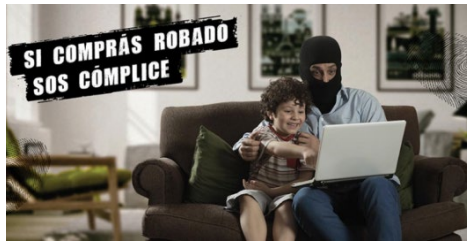
Photo 8. Campaign: Do not buy what was stolen. Graphic piece outdoor signage.