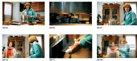
Photo 9. Campaign: “To consume more does not go any further”. Commercial on television