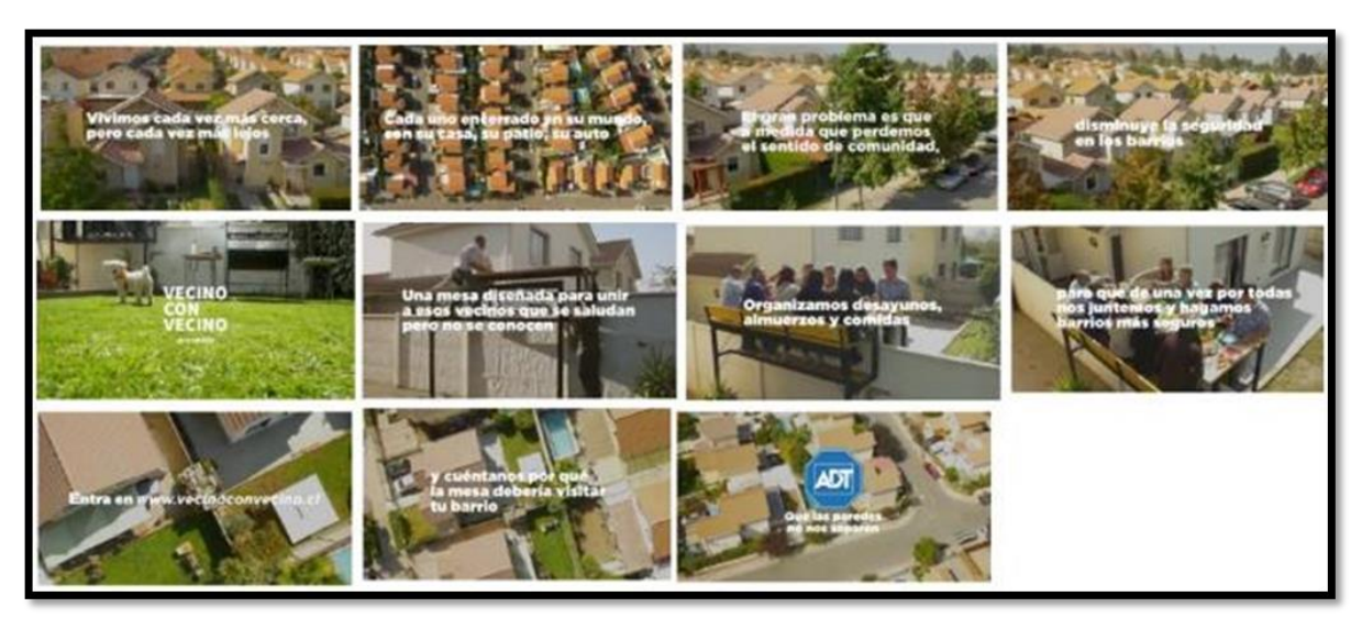
Figure 8 : Frames taken from the campaign under study.

This discovery was what was communicated to the creative agency and the security firm, with which they managed to devise a successful advertising campaign "neighbor to neighbor" that represents and reflects the feelings and deepest attitudes of Chileans concerning security (the piece can be viewed at https://www.youtube.com/watch?v=I5f_I9pRg9s)