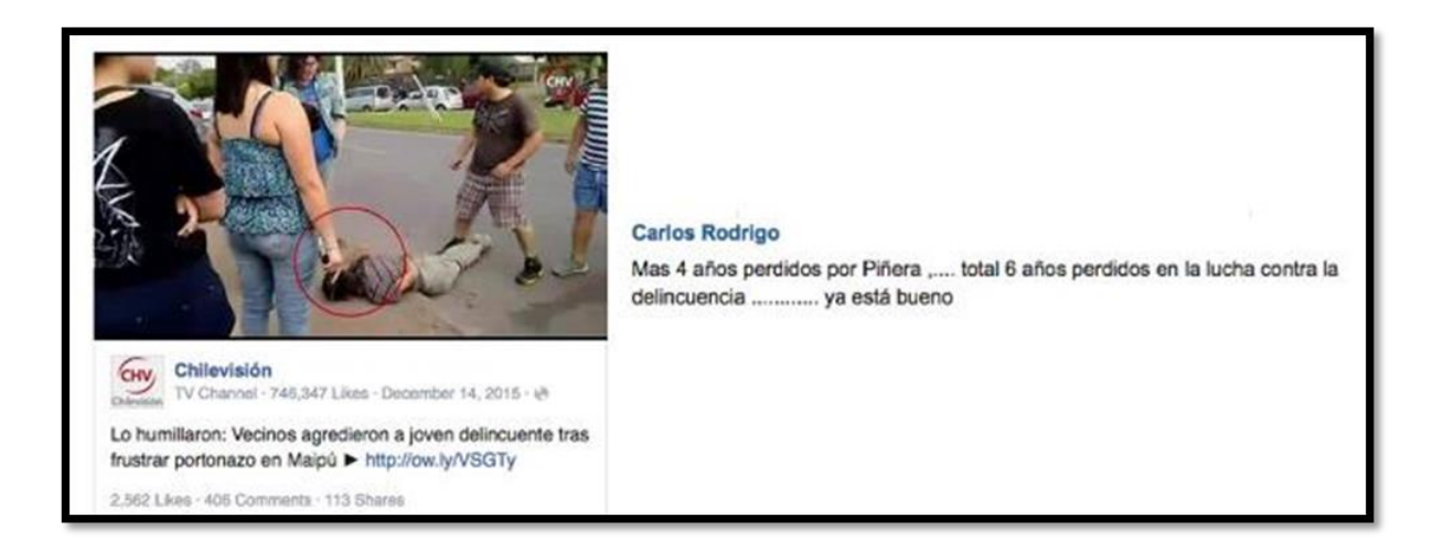
Photo 5: Facebook entries that show the proactivity of anonymous people in terms of security.

7. Need to organize and group: Given the impotence and few solutions, they begin to group and gather to face the problem. To do so, they use Whats App groups organized by neighbors, security apps like SOSAFE and make demands on the authorities organized in groups of neighbors.