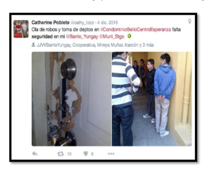
Photo 1: Capture a tweet that shows that feeling of insecurity.

1. Feeling of insecurity: Comments for this segment alluded to a sense of insecurity anywhere, people do not feel safe either in public or private places. Comments such as: "In Alto Las Condes mall, there is no security to enter any time, anyone has free access"; "Lack of security in my neighborhood @Barrio_Yungay", reaffirmed this feeling.