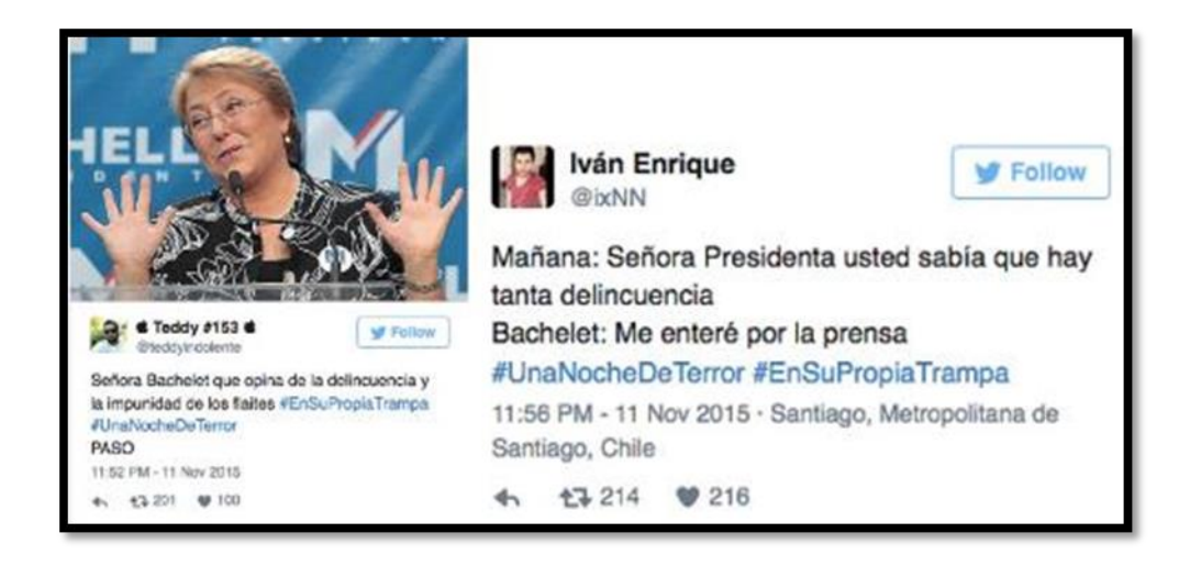
Photo 3: Twitter captures in which citizens show their lack of confidence in the Chilean government.

5. Concern: Robbery is positioned as one of the biggest concerns, it became a trend on Twitter and it is observed that it begins to affect the quality of life of Chileans.