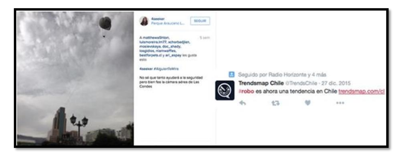
Photo 4: Examples of comments on Facebook and Twitter in which robbery is a major concern among citizens.

5. Concern: Robbery is positioned as one of the biggest concerns, it became a trend on Twitter and it is observed that it begins to affect the quality of life of Chileans.