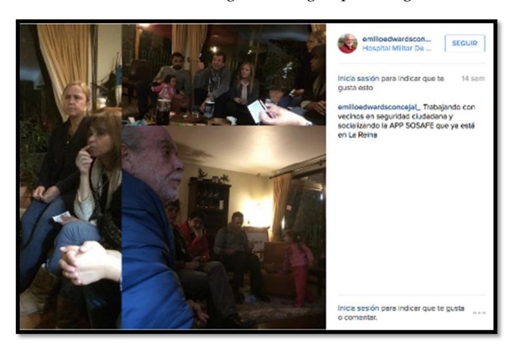
Photo 6 : Facebook entry with photographs that exemplifies how neighbors organize themselves to combat insecurity.

7. Need to organize and group: Given the impotence and few solutions, they begin to group and gather to face the problem. To do so, they use Whats App groups organized by neighbors, security apps like SOSAFE and make demands on the authorities organized in groups of neighbors.