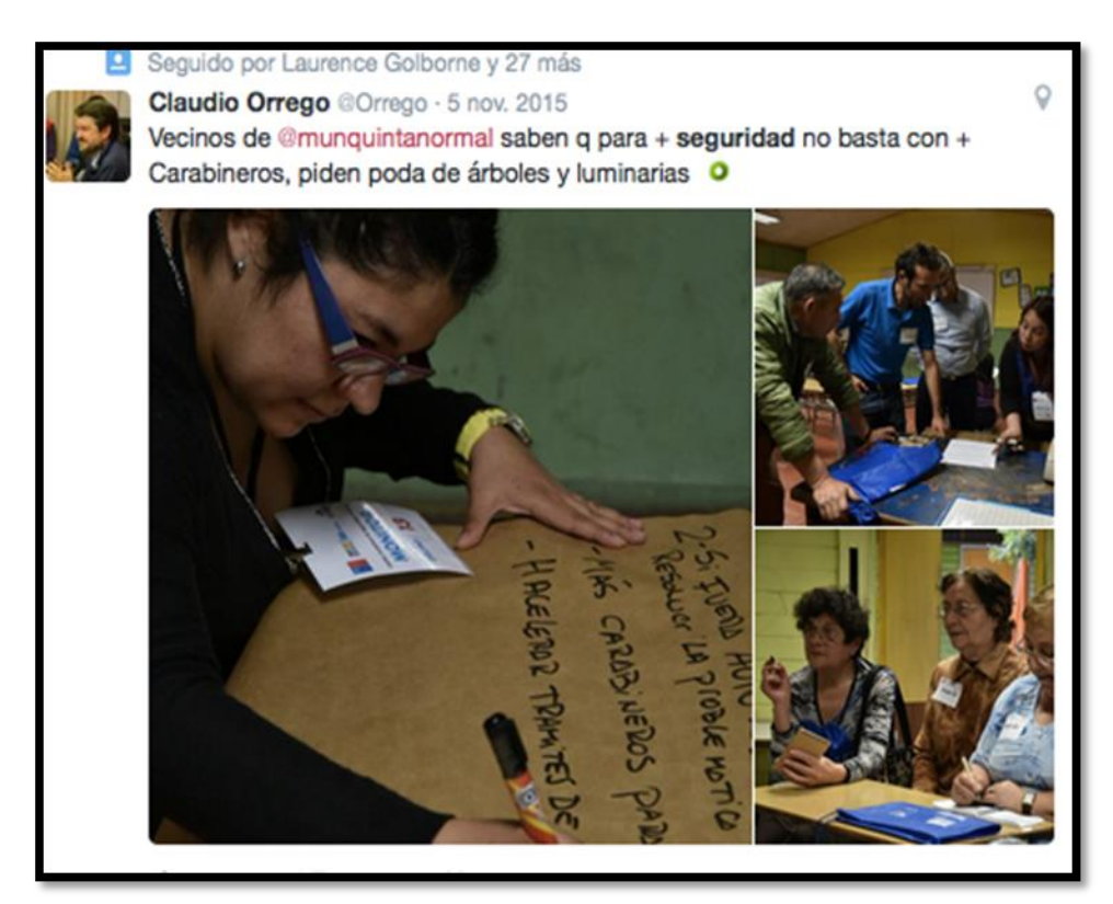
Photo 7 : Twitter entry with photographs showing the neighborhood commitment to get safer neighborhoods.