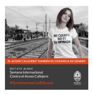
Photo 3. Campaign: Let's end harassment. Facebook piece.