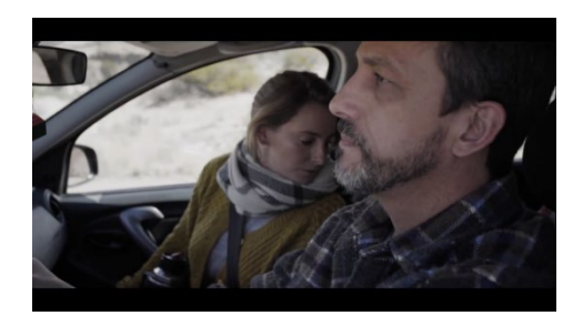
Photo 4. Campaign: Nothing happens until it happens. TV notice.