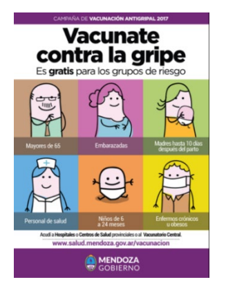
Photo 5. Campaign: Get a flu shot. Graphic piece newspapers and magazines.