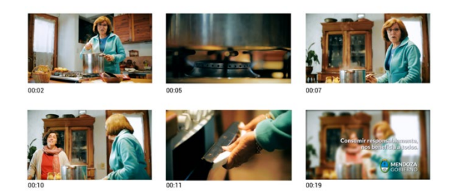
Photo 9. Campaign: "To consume more does not go any further". Commercial on television