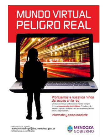
Photo 7. Campaign: Virtual world, real danger. Graphic piece newspapers and magazines.

The audiovisual pieces incorporate the presence of a boy and a female teenager who, assuming the role of presenters, are in charge of talking to their peers about the risks of using the internet. Following this approach, the protagonists look at the camera and emulate a "one to one" communication with direct interpellation. In the first spot, the female teenager, who holds a smartphone throughout the story, begins her speech by pointing out that "On the networks your friends see you, but also many people you do not know". Her words are supported by a red vector illustration that turns on the left side of the screen and illustrates the idea of "networks". Each of these actions is visually supported by a red icon that is then marked as "negative", putting a "dislike" icon in black. The concept of "danger". The second spot stars a boy who starts with the words "Talking with strangers is not good". This preventive behavior is resolved visually, when the boy holds the icon (representing the aggressor) and drags it into a bin.