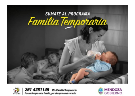
Photo 2. Campaign: Temporary Family. Public road piece.

The pieces opt for the use of photography as the main resource to communicate the concept, so that a situation of positive emotionality can be represented with great realism. It portrays a daily situation that seeks to arouse identification, the chromatic value of the image has a central role: on the one hand, the use of the gray scale together with a slight blur, on the other hand, it projects the color figure which makes it possible to highlight their happiness and materialize the campaign promise. The headline decides to speak directly to the public resolved in two blocks combining typography without italics with calligraphic in yellow, achieving warmth and dynamism. A small underline is placed on the word "temporary", highlighting the transitory nature of the aid. In social networks, the pieces rescue the same compositional elements to present a variation in the represented situations. For television, the testimonial genre is used to communicate the experiences of the protagonists, a succession of middle and first planes