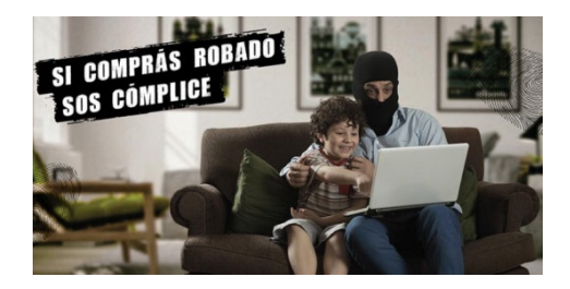
Photo 8. Campaign: Do not buy what was stolen. Graphic piece outdoor signage.