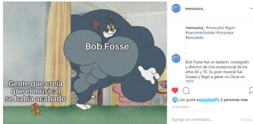
Image 3: the students pay tribute to Bob Fosse, a leading figure in the film musical genre.

In Image 3 we can see a meme, represented with the image of “Tom and Jerry” in which the cat would surprise the mouse by showing unexpected strength. In the description of the photo is the meaning of the image, related to the actor, dancer and film director Bob Fosse and his influence on the cinema of the 1960s and 1970s.