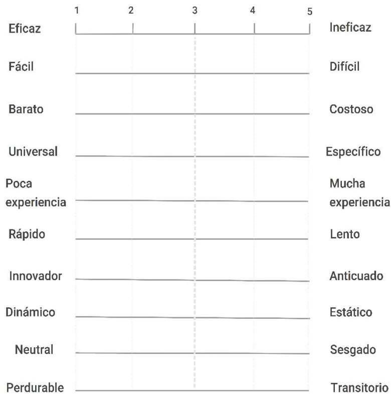
Figure 1. Applied semantic differential.