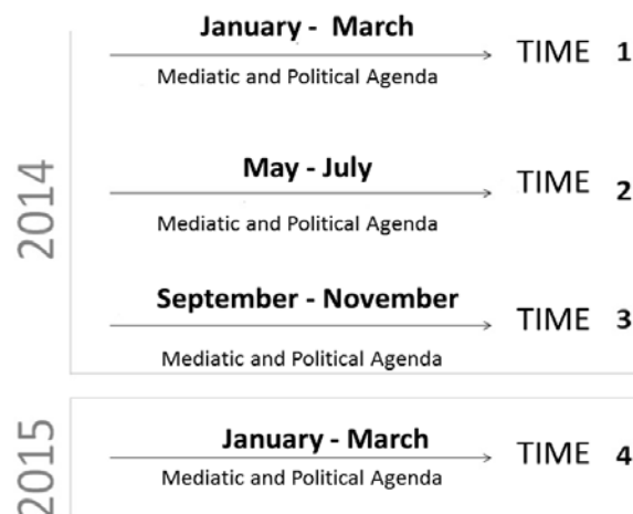
Figure 1 Time framework used for data collection in the study.

To determine the media agenda, an analysis of the content of CMKC was performed during the four study periods described, for which the total of journalistic works published in the news programs Reportes and Con el Sol was taken.