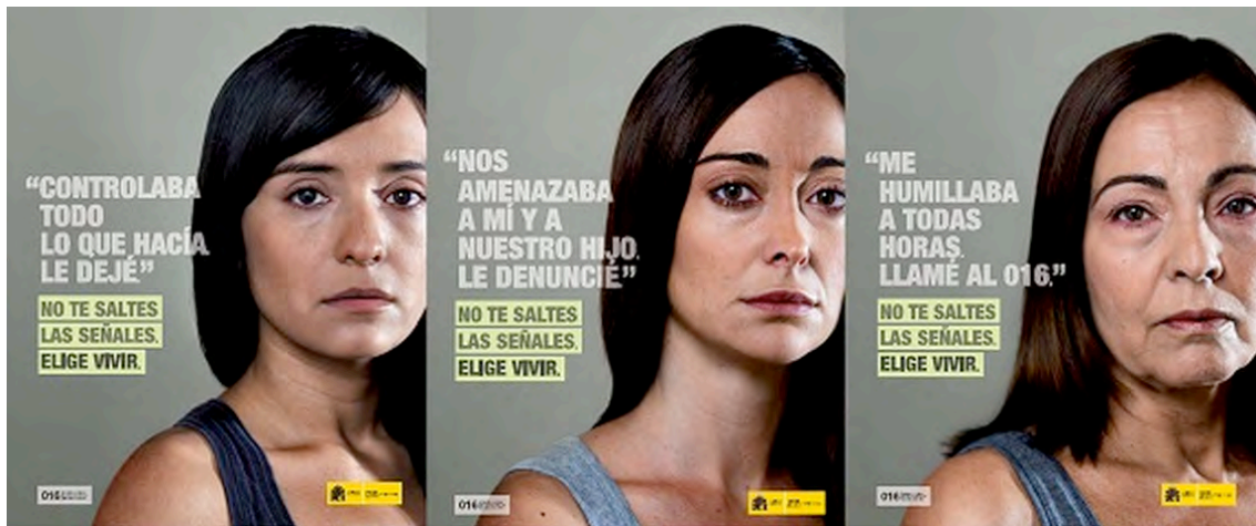
Photo 6: Do not skip signals. Choose to live.

Poster. Three posters are made. Each poster shows one of the protagonists of each spot, together with a phrase in which it is argued why they have decided to end their abusive situation. In addition to the slogan "Do not skip signals. Choose to live ". And the usual logo of the Ministry and 016.