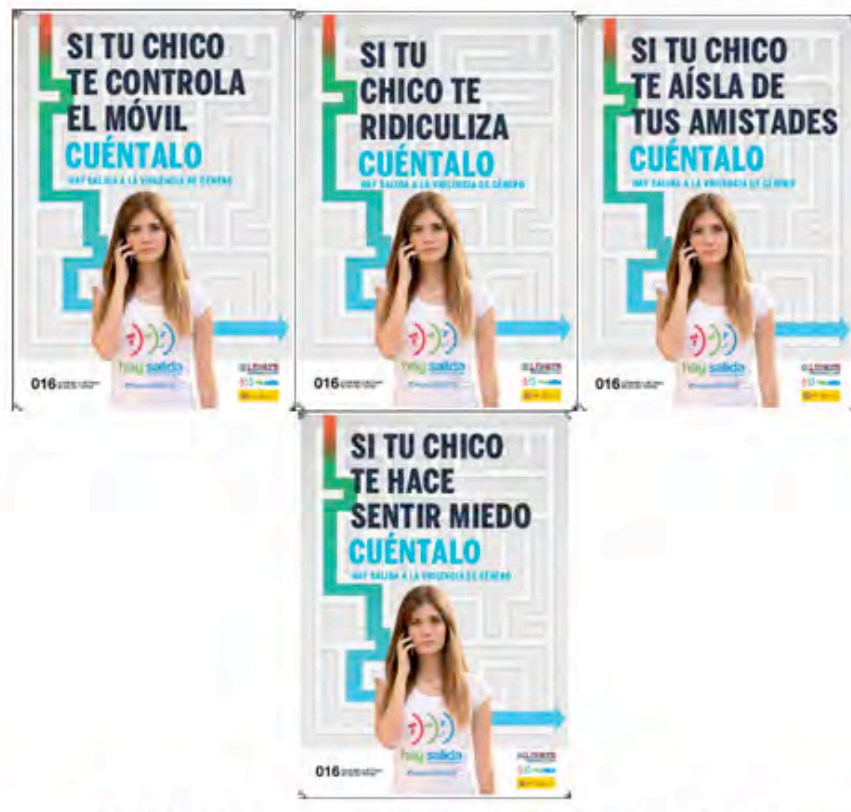
Photo 10: Tell it, there is a way out of domestic violence.

Poster. Posters featuring the same girl in the spot are used. After the girl, we see a maze with the designated way out, which shows "There is a way out" visually. She appears in the foreground with the phone on her ear, representing that she is asking for help. And the same logos are attached in the spot, besides the hashtag #hay salida016 and a logo that invites you to download the FREE App.